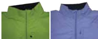
LIME GREEN/NAVY (045)